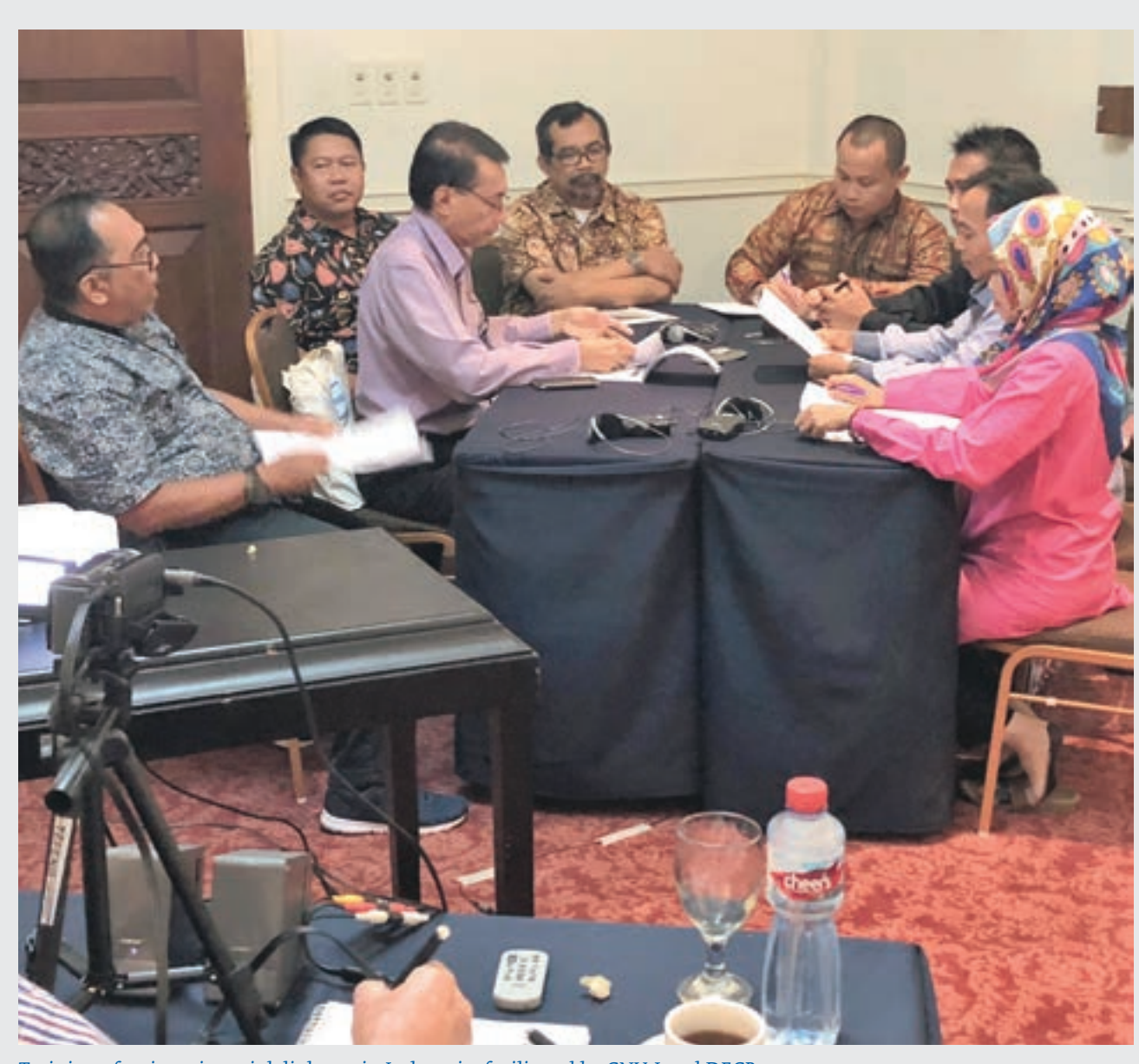
Training of trainers in social dialogue in Indonesia, facilitated by CNV-I and DECP

struck me most since my start on 1 January is the enormous and unabated enthusiasm of the DECP team for working with our partner organisations. DECP has realised great successes, such as the establishment of a Foundation of Labour in Peru last year. But of course we also encounter setbacks when situations develop more slowly or different than we had intended. Nevertheless, the optimism of building positive change always dominates and leads to interesting results, which you can read in this Annual Report.