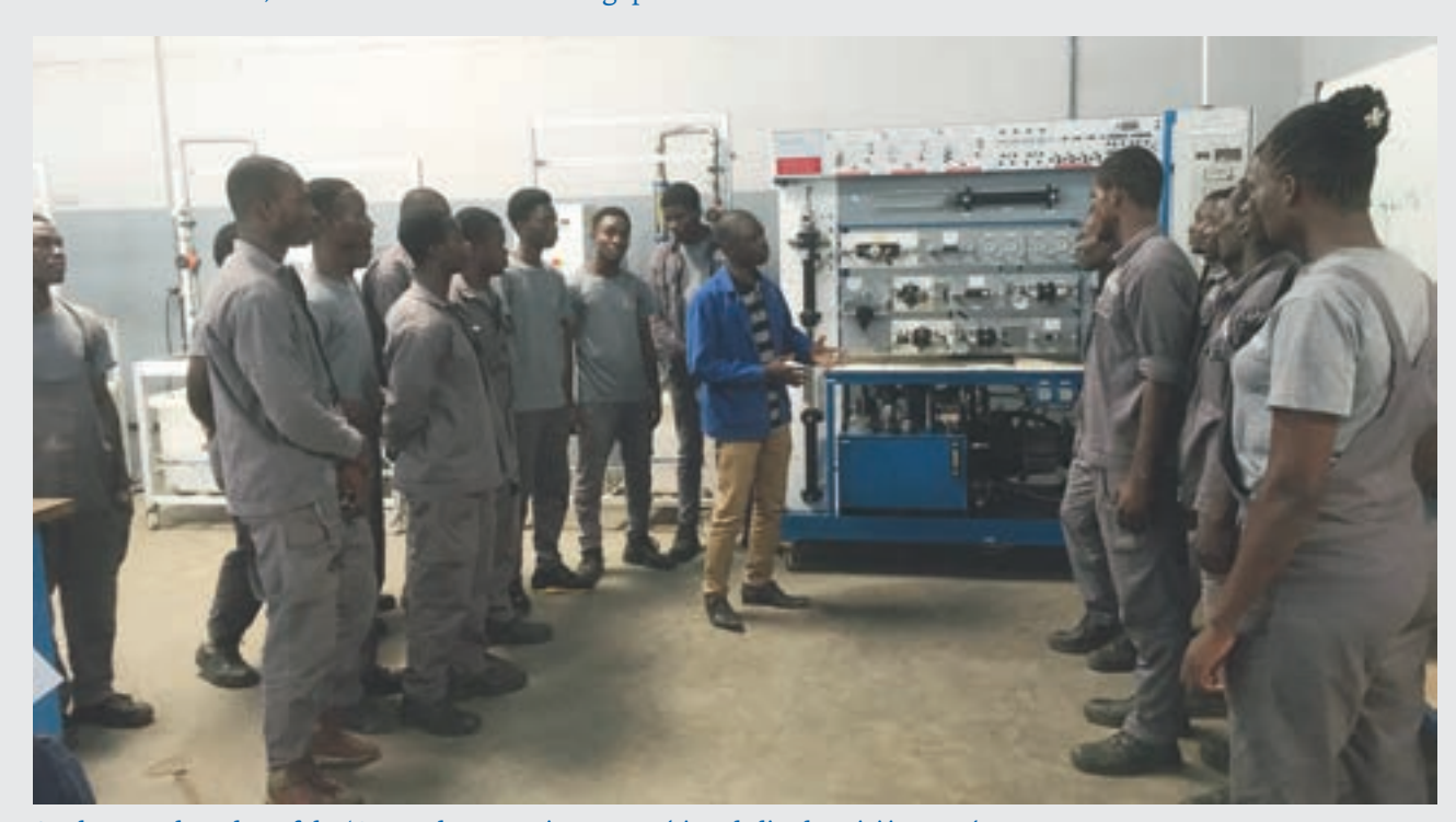
Students and teacher of the 'Centre de Formation aux Métiers de l'Industrie' in Lomé, Togo

The answer to that is not easy to determine. It depends on a number of aspects. But one thing is sure: doing nothing is not an option. That is why, in 2018, DECP continued to conduct cross-cutting workshops on this subject. In Manila (the Philippines), Abidjan (Ivory Coast) and Nairobi (Kenya) in total around 60 representatives of 18 countries got their heads together on this challenging issue. Country-specific workshops were conducted in Mongolia, Indonesia and the Philippines. This led to the development of methods that can be used to analyse and define the skills gap and a complete action list which might formulate answers. A particular issue that has been unfolded is how to organise internships and apprenticeships in such a way that they highly contribute to the learning process.