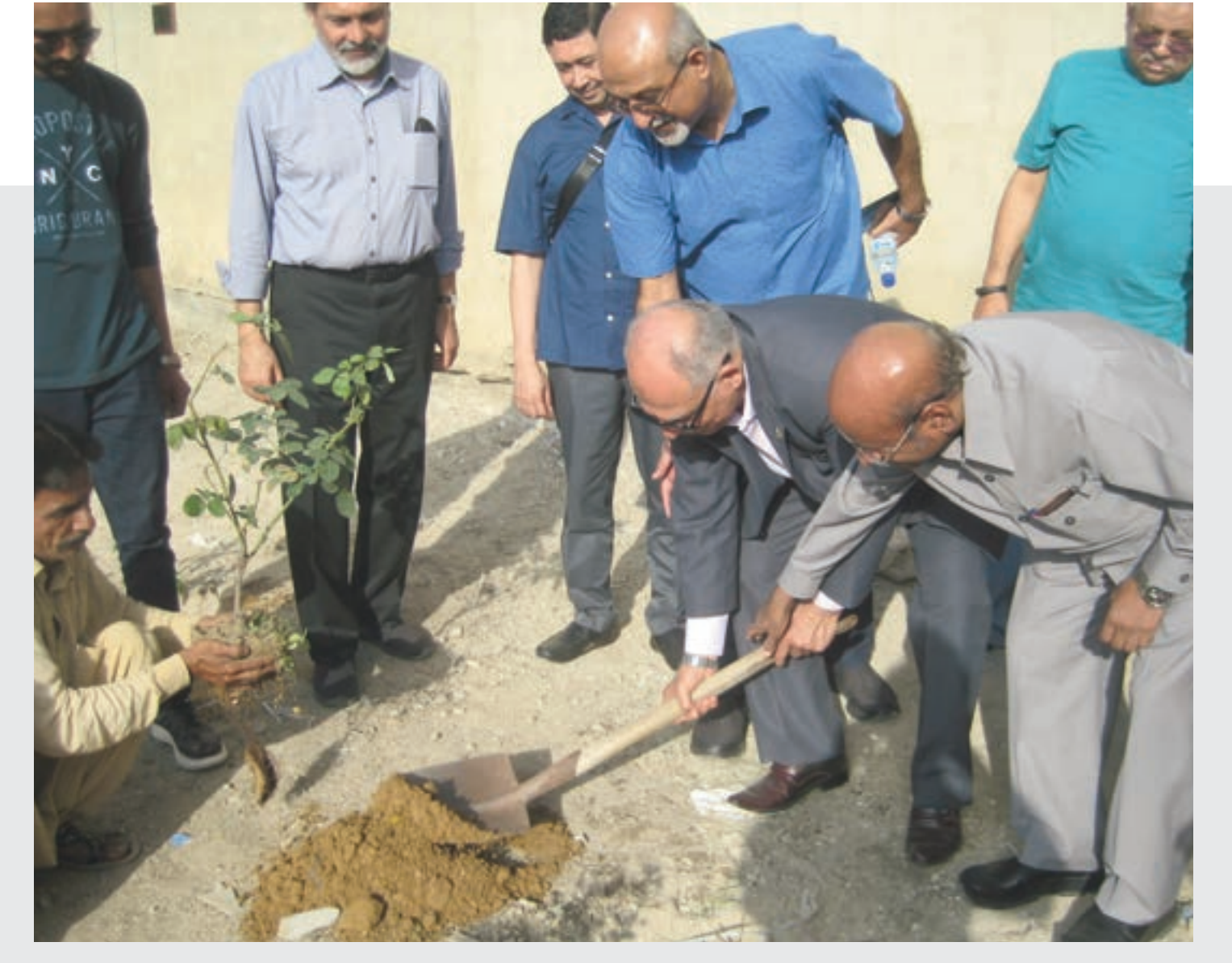
SAFE, February 2018. Building the future literally

As a relatively small organisation, DECP underlines the importance of working together with other organisations. Cooperation with the Dutch trade unions CNV Internationaal and Mondiaal FNV turned out to be very successful in Peru, Indonesia and Vietnam, amongst other examples. Strategic cooperation with ITC-ILO, the training centre of ILO, has led to the implementation of a strong EBMO (Employers' Business Member Organisations) training course. Together with some likeminded Scandinavian organisations, agendas are shared to determine whether and how we can work together to accelerate and scale up several processes. As far as connecting the needs of partner organisations and their members to Dutch expertise is concerned, DECP is constantly engaging with the PUM organisation (Netherlands Senior Experts), NLinBusiness and Dutch representatives