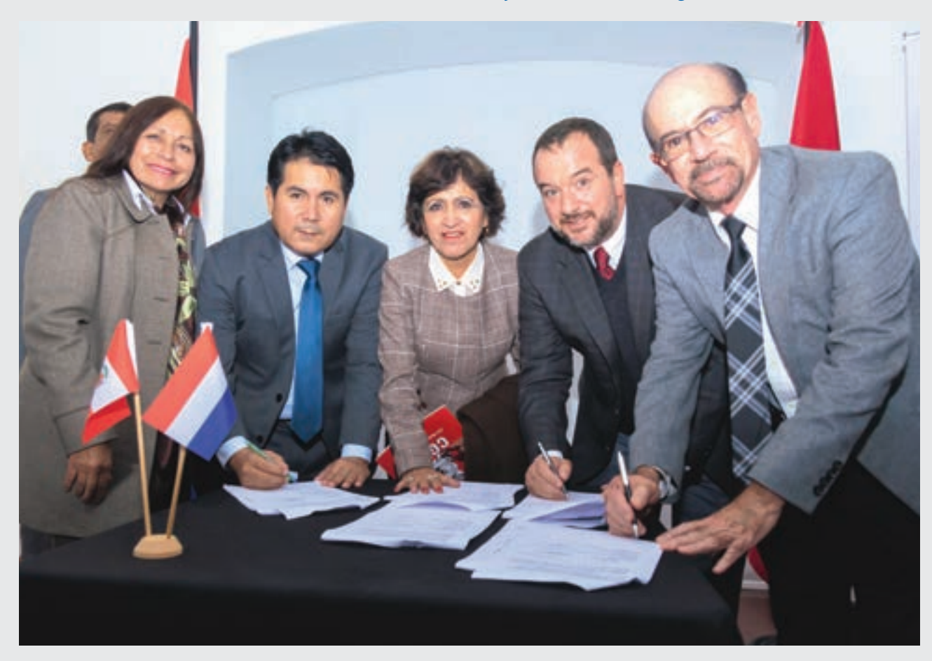
Peru: Representatives of trade union CGTP and employers' organisation SNI establish the Labour Foundation

During the meeting a number of concrete projects in the field of working conditions and absenteeism were presented. For example, the employers' federation in Santa Cruz, Bolivia, together with the regional union, has established a Council for Safety and Health at Work. The Peruvian Sociedad Nacional de Industrias (SNI) is working on a project to transform the labour inspectorate from a body of lawyers who hand out penalties into an organisation of doctors and economists who help SMEs create good working conditions. ANDI has done extensive research into sickness absence among a thousand employers in Colombia. The results of the research are now being used to give politicians, the judiciary and other stakeholders insight into the harmful consequences for employers of the very detailed laws and regulations in this area.