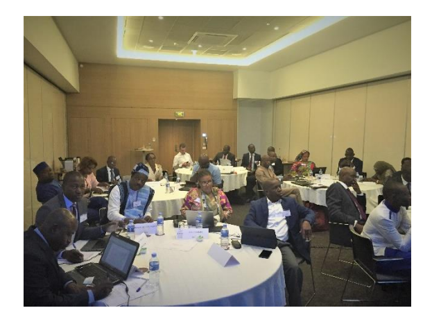
Cross-cutting workshop by DECP on skills development. Abidjan, Ivory Coast, March 2018

relatively easy be developed with the right tools.